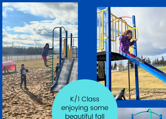
K/1 Class enjoying some beautiful fall weather!